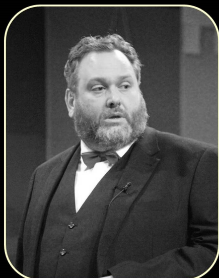
THE REAL INSPECTOR HOUND BY TOM STOPPARD