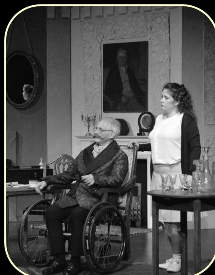
THE REAL INSPECTOR HOUND BY TOM STOPPARD