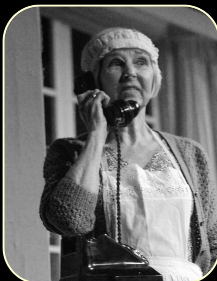
THE REAL INSPECTOR HOUND BY TOM STOPPARD